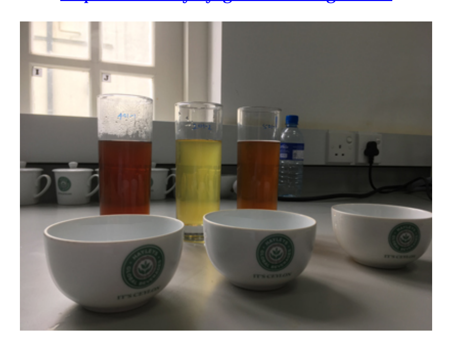
The Tea Research Institute (TRI) in Nuwara Elya District <a href="http://www.tri.lk/">http://www.tri.lk/</a>