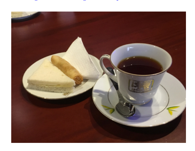
The Sri Lanka Tea Board Headquarters in Colombo http://www.pureceylontea.com

Some highlights of the journey included: