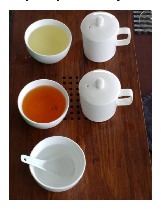
Pedro Tea Garden and Factory in Nuwara Eliya District <a href="http://www.kvpl.com">http://www.kvpl.com</a>