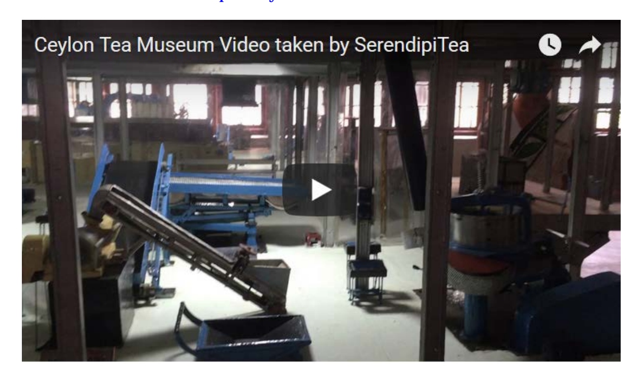
Loolecondera Tea Garden in Kandy District <u>Loolecondera-estate-</u>