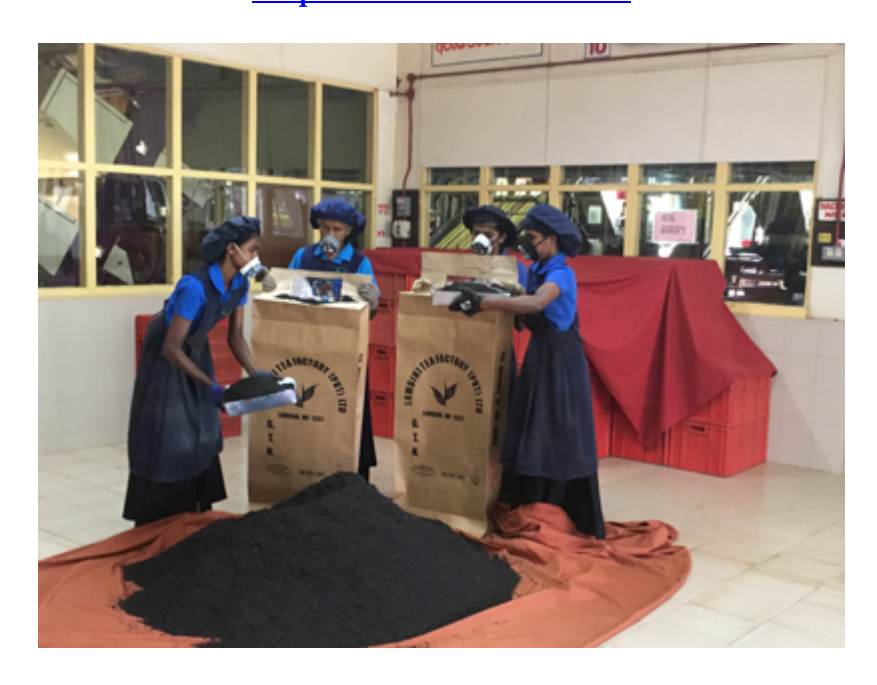
Ahinsa Organic Tea Factory in Ruhuna District <a href="http://www.ahinsatea.com">http://www.ahinsatea.com</a>