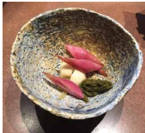
Ginger Sprouts

Japan is revered for, amongst many other things, its extraordinary green tea, including matcha, its solemn tea ceremony and exquisite cuisine. And, tsukemono (meaning “pickled things”) must be included in this list. According to Yabai.com, “some culinary experts say that the Japanese pickle almost every type of vegetable and serve them with almost all well-known dishes and meals. In Japanese history, tsukemono was a way for the locals to preserve food and make them last for days or months, prior to the age of the refrigerator. This is their way to ensure that food can last indefinitely. Traditional methods include salting and vinegar brining, while more traditional methods include more complicated methods such as fermentation.”